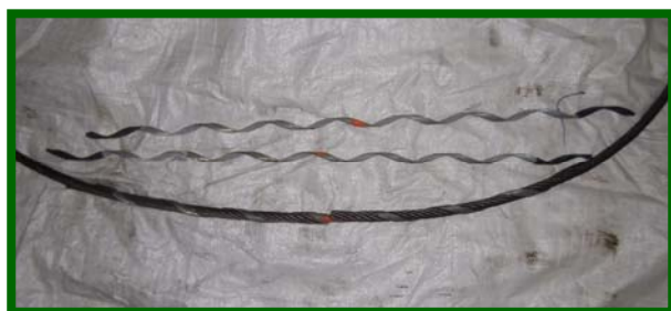
Figure 16(9.2.15): Reeving Splice