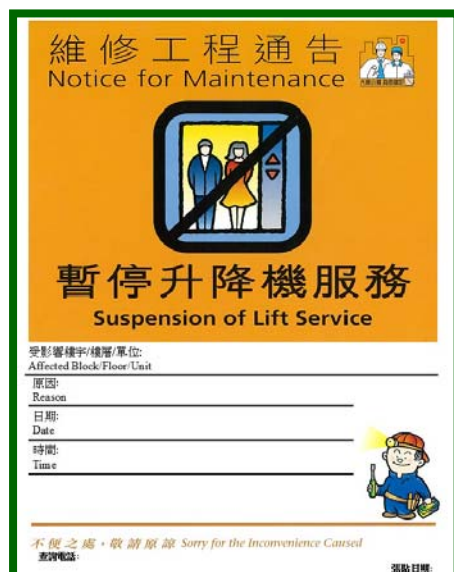
Figure 14 (9.2.3):

Proper warning notices warning that the lift is out of service should also be posted at prominent positions