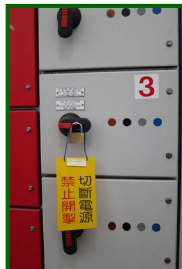
Figure 9(8.5.3c): Source of electrical energy to be properly isolated with lockout/ tagout